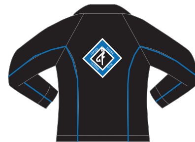
Contour Jacket back view